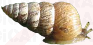
Cochlicella barbara (Small Conical, Small Pointed Snail Banded Conical Snail)