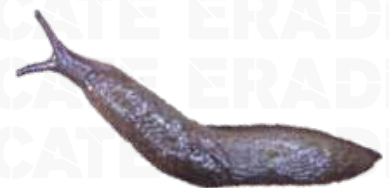
Deroceras panormitanum (Brown Field Slug, Caruna Slug, Sicilian Slug)