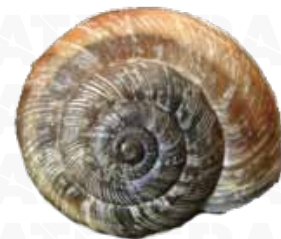
Microxeromagna armillata (Small Brown Snail, Citrus Snail)