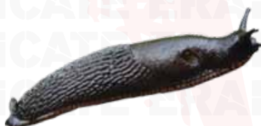
Arion hortensis (Small Striped Slug)