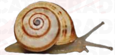
Theba pisana (White Snail, Italian Snail Small Grey Snail)