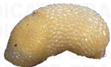
Arion intermedius (Hedgehog Slug)