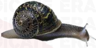
Cantareus aspersus (Common garden snail, Brown Snail, Speckled Escargot)

Listed below are just some of the more prominent pest snails and slugs within Australia. (Images shown are not to scale).