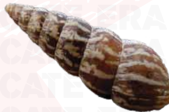
Cochlicella acuta (Pointed Snail)