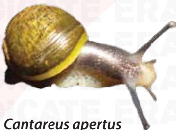
Cantareus apertus (Green Snail)