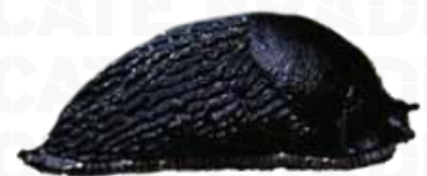
Arion ater (Black Slug)