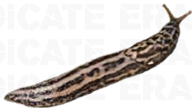
Limax maximus (Great Grey Slug, Tiger Slug, Leopard Slug, Great Striped Garden Slug)