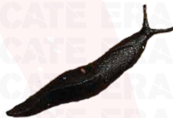
Milax gagates (Jet Slug)