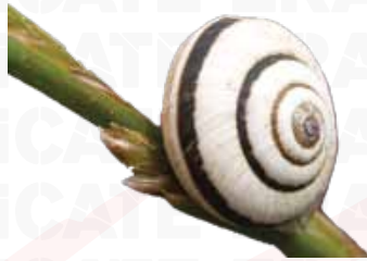
Cernuella virgata (Vineyard Snail, Common White Snail Striped Snail)