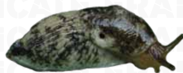
Deroceras reticulatum (Grey Field Slug, Milky Slug)